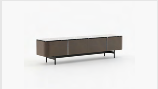
Norman TV Cabinet: A sleek and functional piece for your entertainment needs.

This showroom is a partnership with Le Mirage Fit Out, a long-standing partner of Laskasas, known for its excellence in delivering world-class interior design projects.