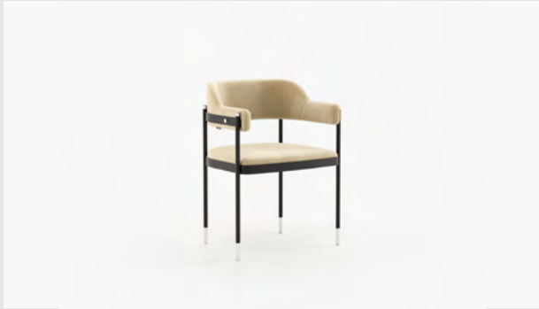
Dale Chair: A versatile chair that pairs well with any dining table.