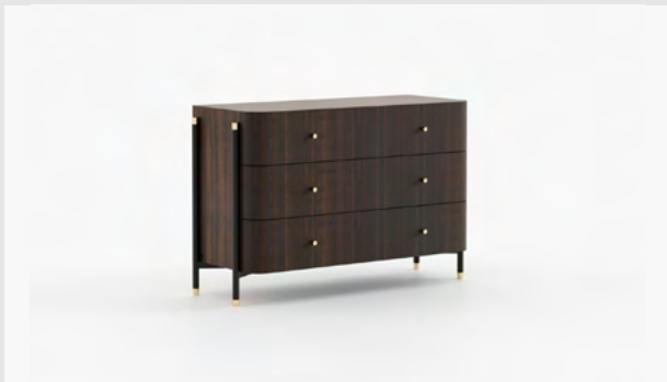
Rosie Chest of Drawers: Stylish storage solution with generous space.