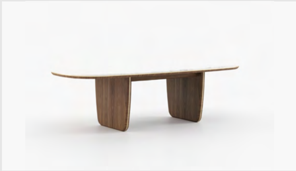
Jeane Dining Table: A stunning dining table that serves as the centrepiece of any dining room.