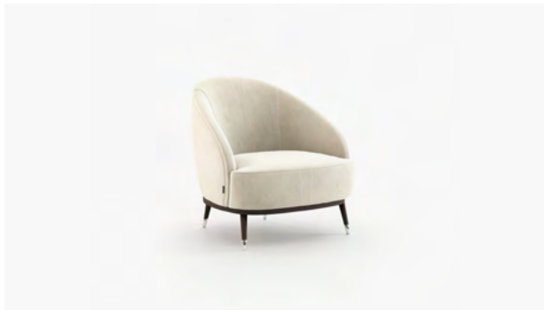
Hector Armchair: A stylish and cosy armchair that adds a touch of sophistication to any space.