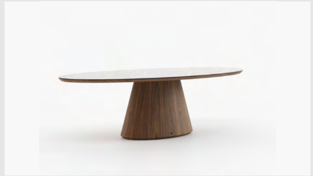
Kelly Dining Table: Elegant and functional, perfect for casual and formal dining.