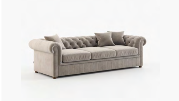
Chester Sofa: A timeless piece with deep button tufting and elegant lines.