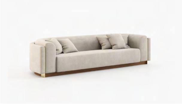
Wellington Sofa: An elegant and comfortable sofa that combines classic design with modern comfort.

Our showroom features a carefully curated selection of products that exemplify our dedication to quality and design. Each piece is chosen to inspire and assist customers in creating beautiful and personalised interiors. Here are some of the standout products: