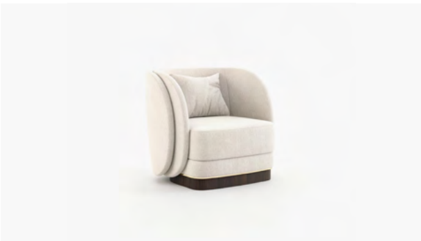
Ambrose Armchair: Combining comfort with elegance, ideal for relaxing.