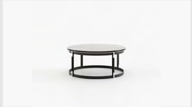
Lyssa Coffee Table: A beautifully designed coffee table that adds a touch of elegance to living spaces.