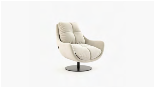
Sophia Armchair: A chic and versatile armchair that complements various decor styles.