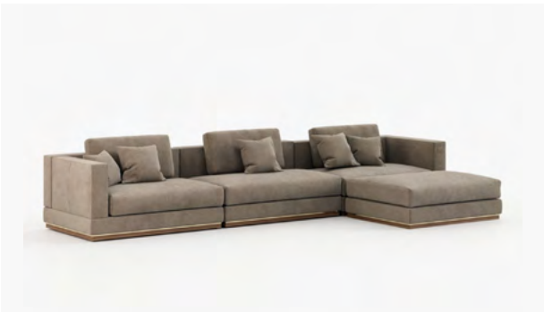
Fletcher Sofa: Sleek, contemporary and modular, perfect for modern interiors.